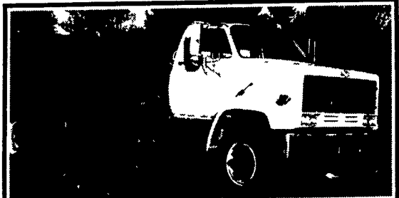
1988 Chevy Truck 33,000 GVW, 136K Diesel, 210 H.P., 6 Sp., Runs Like New • $10,900