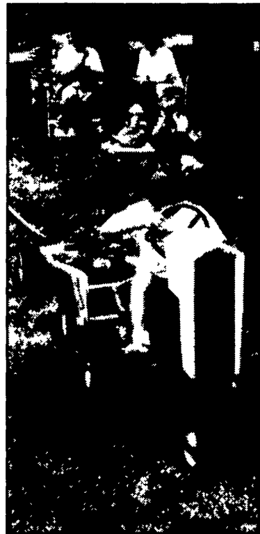
A determined youngster competing in the pedal tractor pulling contest, a popular kid's event at the Tioga/Bradford Counties Farm-City Day. This picture was taken at the 1999 Farm-City Day at the Ogden Farm in Lawrenceville.

For the youngsters, there will be a pedal tractor contest which uses tractors specially designed for pulling. All youth four years of age through 12 years old are