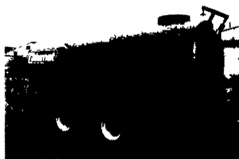
1990 Calumet 3250 Gal. Tank Spreader, 19Lx16.1 Tires, 540 RPM $6,800