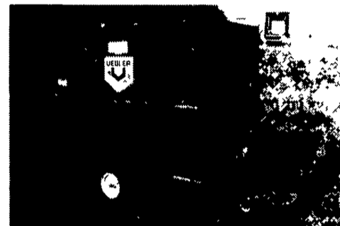
(2) Uebler 812 Feed Carts - excellent condition $3,200