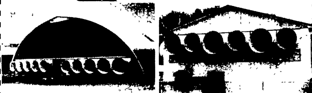
Free Stall Barn, Elizabethtown, PA