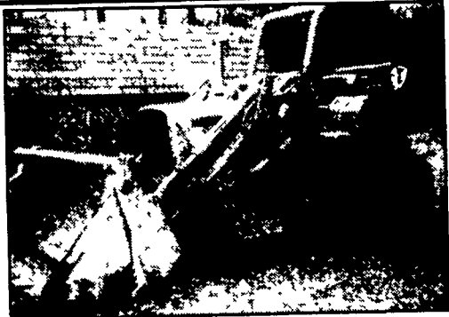
JD 450C with Loader, 4 Way Bucket, Block Heater, Nice Condition $11,500 • 610-273-2134