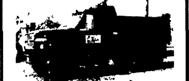
1984 Ford F800 w/Single Axle Dump Bed, Cat Diesel, 84,000 Original Miles, VG Condition, Road Ready $8,500