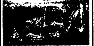
1977 John Deere 450C, Crawler loader w/backhoe, good undercarriage, fresh paint, work ready. $17,000