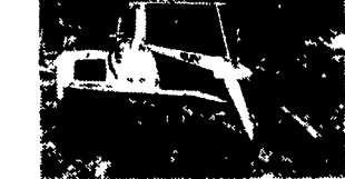
(3) 2000 ASV MD2810T, GP Bucket, Auxiliary Hydraulics, 83HP Isuzu Turbo Diesel, Low Hours, Work Ready $24,500 to $26,500