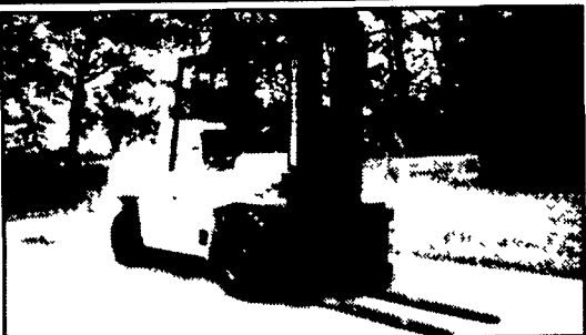
Hyster, pneumatic 11,000 lb. cap., re-man. engine, LP/PS/SS, triple mast 96-197, excellent condition. ....$9,600

C. Betz Forklift Sales & Service 717 • 485 • 0410