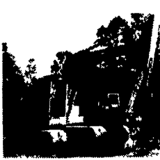
(2) Cat 953LGP - 1988 cab, w/4 in 1 bucket & 1992 orops, gp bucket w/teeth, v g undercarriage & condition, work ready, from $42,000