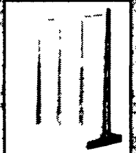
T-wall Bunker Silo

"My only regret is that I wish I had made the pit under the barn deeper."