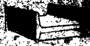
High Capacity Hoop-style Feed Bunker