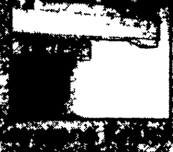
Pig "Waffle Slat" 3000 sq ft