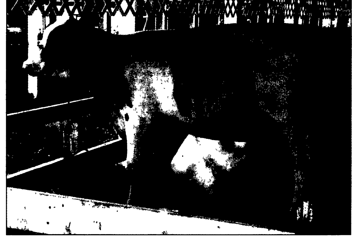
Nine months old, EK-Oseeana Lee Abby-ET was top-selling female at the National Holstein Convention Sale.