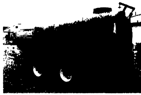
1990 Calumet 3250 Gal. Tank $6,800

Patz 16-20' 98-B silo unloader - rebuilt..$3,800 Patz RD-820 24' ring drive, hexapod and winch (very good condition)......$6,150 Patz 12-16' 98-B silo unloader - rebuilt..$3,700 Patz 325 cu.ft. trailer mixer - new augers $9,500 Patz 12" belt feeder - 45'