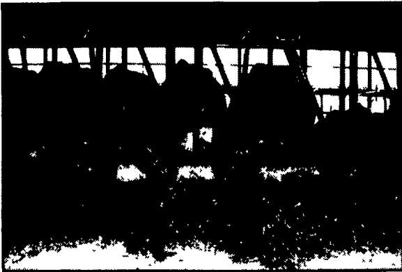
Auto Release Self Locks