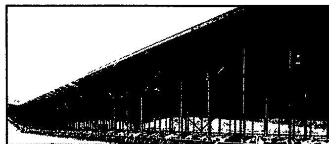
Agway Cumberland Valley. 3600 Head Capacity from 2 Day to 23 Months Newburg, PA

Our Quality Shows - We Built Our Business On It!