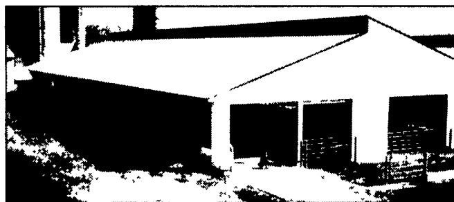
Good View Farm 450 Stall Dairy Center with Holding Area. Canton, PA