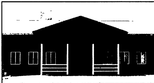
Graywood Farms - Complete Dairy Complex Wakefield, PA