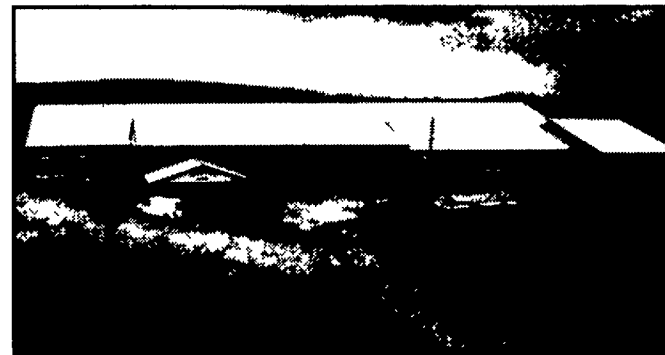
Troester Dairy Farm 420 Cow Freestall Barn Mifflinburg, PA (Union Co.)