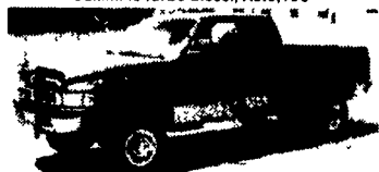
SHORTBED QUAD CAB 97 DODGE 3500 4x4 These Trucks Are Very Nice To Drive, Come See For Yourself, 24 Valve Cummins, Auto, Loaded Laramie SLT, Tow Pkg., Remaining New Tk Warranty