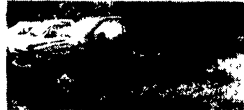
11 FOOT MECHANIC'S BODY • 4 WHEEL DRIVE 99 FORD 450 SUPER DUTY Platform Between Cab & Body For Your Welder, Etc Powerstroke Turbo Diesel 6 Sp. Manual, Only 48,000 Miles