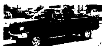
WORK STYLE FORD SUPER DUTY PICKUP 2000 FORD F250 4x4 Pickup, Powerstroke Turbo Diesel, 6 Sp, A/C, Lock out Hubs, Heavy 800 G.V.W., Runs Great, Factory Warranty