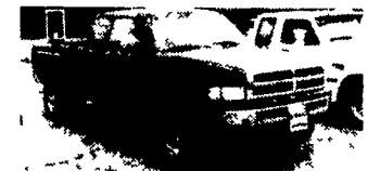
96 DODGE 2500 CLUB CAB 4x4 Very Clean, Only 75,000, Original Miles, Excellent Body, Cummins, Turbo Diesel, Auto, A/C, Tow Package $19,500