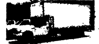
16 FOOT BOX & WHEEL DRIVE 99 FORD 550 Super Duty A Very Hard To Find Tk, Only 67,000 Miles, Remaining New Tk Warranty, Powerstroke, Turbo Diesel, 6 Sp., Will Sell As Chassis