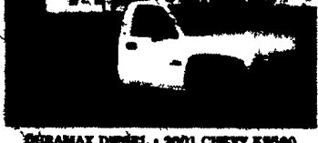
99RAMAX DIESEL • 2001 CHEVY K600 4 WHEEL DRIVE Only 5,000 Miles, Remaining New Tk Warranty, Duramax, Allison Trans, A/C, Gooseneck & Class 3 Hitches, $28,900