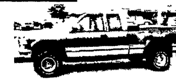
CRUISING TRUCK 94 CHEVY K1500 SUPER CAB STEPSIDE 4 Wheel Drive, 1 Owner, 350, V8 AT, Capt Chairs Console, Aluminum Wheels, Very Nice A Must See $13,900