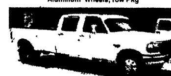
5 SP DIESEL • 94 FORD F350 CREW CAB DUALY 2 Wheel Drive, Very Clean, Only 55,000 Miles, Loaded, XLT, Powerstroke Turbo Diesel, Loaded XLT, Check it Out