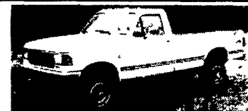
SOLID FRONT AXLE 1 TON PICKUP 1991 FORD F350 Great Truck for Around the Farm, Diesel Power, Auto, A/C, Dual Tanks, Lock Out Hubs