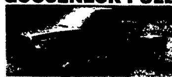
4x4 CHASSIS CAB, 2001 DODGE 3500 A Real Nice One, Super Clean, Only 81,000 Miles, 24 Valve Cummins Turbo Diesel, AT, A/C, Aluminum Wheels, Short 60" C.A. Remaining New Tk Warranty