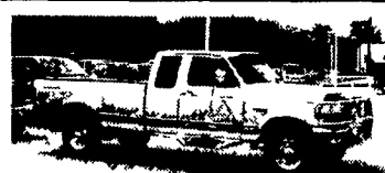
42,000 ORIGINAL MILES 96 FORD F250 SUPER CAB 4X4 Beautiful, A very nice SuperCab, Powerstroke Turbo Diesel, Auto, A/C, Fact Tow Pkg