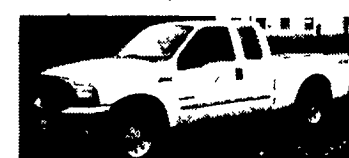
WAITING FOR YOU, 2000 FORD F250 SUPER CAB SHORTBED 4X4 Real Nice Only 31,000 Miles, 6 1/2 Ft Bed, Powerstroke Turbo Diesel, AT, A/C, 40/20/40 Seat, Aluminum Wheels, Tow Pkg