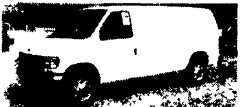
WORK VANS 96 FORD E-350 Heavy 9500 GVW, Great Van For The Heavy Load, Powerstroke Diesel, Auto, A/C, 67,000 Original Miles