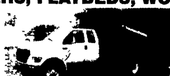
950 SUPER CAB DUMP • 2000 FORD SUPER DUTY Under CAB, Like New, Only 8,000 Miles, Powerstroke Diesel, 6 Spd., A/C, Room for the Crew, Very Nice