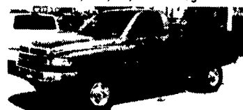
24 VALVE CUMMINS • 2001 DODGE 2500 4X4 A Real Powerhouse, Auto, Loaded, All Options, Like New, With All Remaining Warranties, Only 18,000 Miles