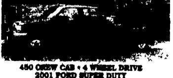
450 CREW CAB • 4 WHEEL DRIVE 2001 FORD SUPER DUTY The only way to Travel, Loaded XLT, only 24,000 miles, Powerstroke Turbo Diesel, AT, All Options, Aluminum wheels, Capt.Chairs, Console. Remaining New TK Warranty