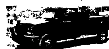
HEAVY CHEVY • 89 CHEVY K3500 4x4 DUALY PICKUP Big, Strong 454 V8, Auto, A/C, Tow Package Real Strong & Waiting to Pull the Big Load. Runs Great Well Maintained $11,900