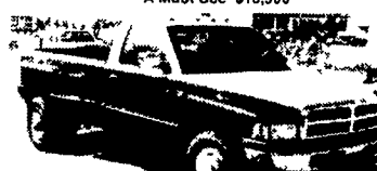
2 WHEEL DRIVE • 95 DODGE 3500 Cummins Turbo Diesel, AT, A/C, Tow Pkg, Chrome Simulators, Great Truck, Only $10,900