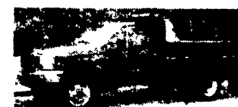
99 FORD F450 SUPER DUTY V10 Power, 5 Sp., Manual, Very Clean & Only 34,000 Miles