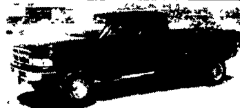
QUAD CAB DUALY 99 DODGE 3500 4x4 Real Nice, Real Clean, Only 26,000 Miles, 24 Valve Cummins Turbo Diesel, Auto, A/C