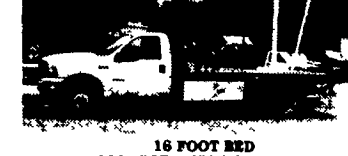
16 FOOT BED 2001 FORD 550 SUPER DUTY Heavy 19,800 GVW Powerstroke Turbo Diesel 6 Sp. A/C Remaining New TK Warranty, Only 54,000 Miles, Steel Bed