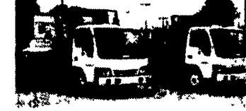
CAB OVER DUMPS CHEVY W-4 (ISUZU) Turbo Diesel, Auto, 12 Foot Steel Bed, Great Fuel Mileage, 2 Available, 97 & 95