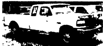
92 FORD F250 SUPER CAB 4x4 Great Running Truck Diesel Power, Auto, A/C, Lock Out Hubs Tow Package $11,900

PHONE 717-274-2000 Toll Free 1-800-650-1420