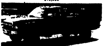
$12,900 • 95 DODGE 2500 4X4 Great Tk for Work or Around the Farm, 5 Sp Trans, Cummins Diesel