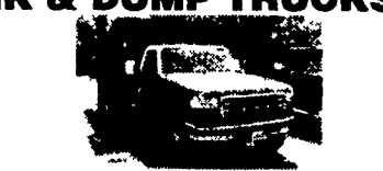
MECHANICS SPECIAL DUMP TRUCK • 94 FORD SUPER DUTY 7.3 Turbo Diesel 5 Spd., A/C, 12 Foot Bed, Needs Engine Work, $11,900