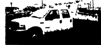
4 DOOR DUMP • 2000 FORD 550 SUPER DUTY Very Hard To Find, So Don't Wait, Only 22,000 Miles, New Tk Warranty, Powerstroke Turbo Diesel, Auto, A/C, Heavy 17,500 GVW