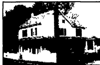
13209 Greensburg Road

The real estate with improvements is located in Washington County's 14th Election District along the north side of Greensburg Road near its intersection with Bikle Road. The land area is approx- imately 3.15 acres which is better described in Liber 1262, Folio 734 of the County land records.