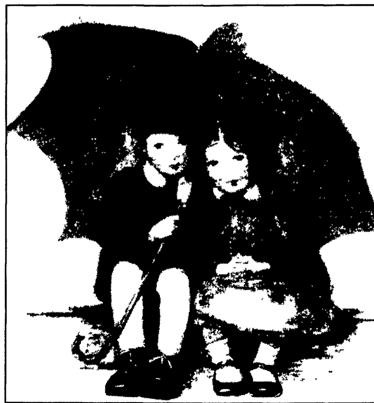
Magazine cover designed by Jessie Willcox Smith for "Good Housekeeping," April, 1926. Sold at auction for $30,000.