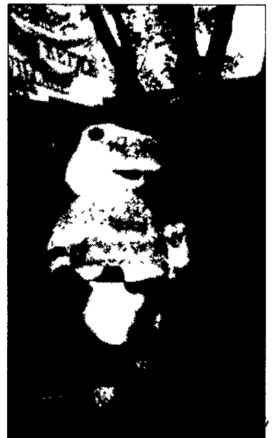
Turkey Hill's dairy cow does her part in convincing kids to drink milk and eat ice cream.

People from all over the world attended the event, which is famous for his rhubarb pie baking contest, the world's only rhubarb race car derby, rhubarb arcade games, and lots of musical entertainment.