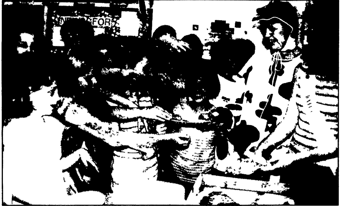
Fourth-graders at Schaefferstown Elementary School won a school contest sponsored by Lebanon County Dairy Promotion Committee. In exchange for collecting the most real seals — 2,433 — the class received a pizza. Eight large pizzas were required to fill the appetites of the 4th graders.