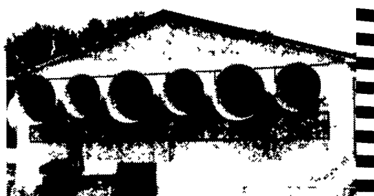
Tie Stall Barn, Womelsdorf, PA