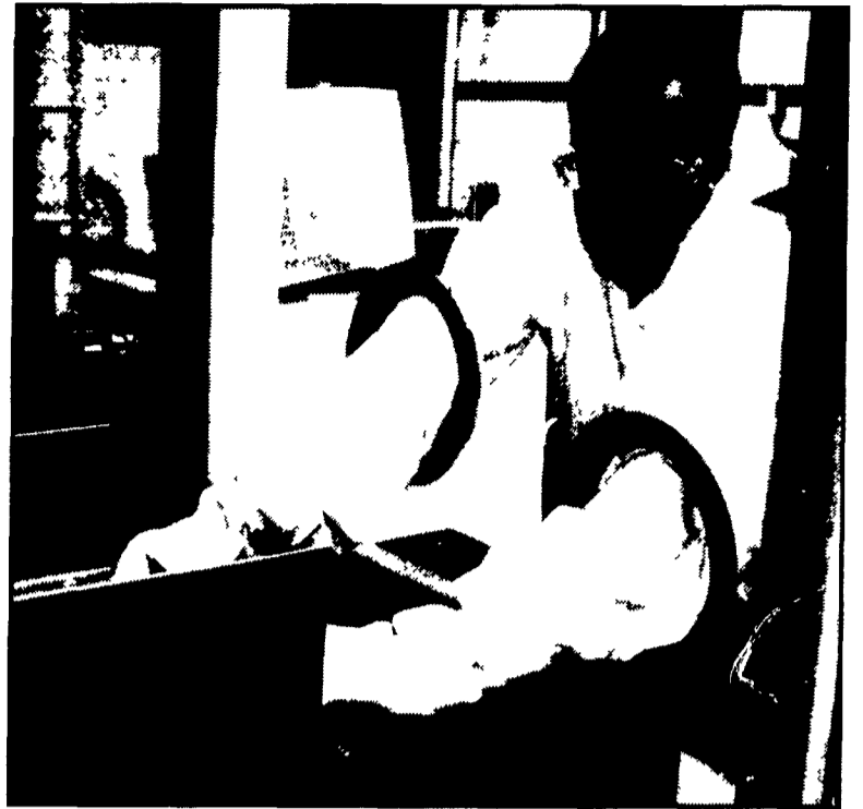
Gerald Sapers stands at the end of the pilot plant containment chamber, which has its own steam decontamination system.

This plant allows the research team "the ability to work with precisely controlled flow rates and exposure times, temperatures, and other treatment conditions. Most of the things that we do in the lab in beakers and flasks has to be tested on a large scale," said Sapers, "and this can be dangerous when working with pathogenic bacteria."