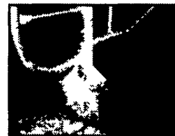
Save Your Curb With Our Stainless Steel Curb Model