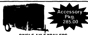
Accessory Pkg. 285.00 SINGLE AXLE TRAILERS