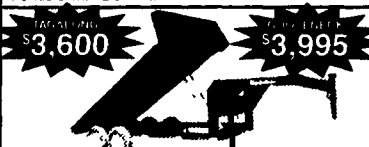
7 x 12 Gooseneck Dumper 10 000 GVW Self Contained Deep Cycle Marine Battery Brakes on both Axles Steel Bed Adjustable Coupler Stake Pockets Rub Rails $3,600 $3,995