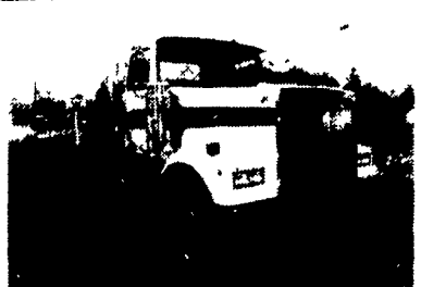
1997 Western Star Model 4964FX WB 272" Cummins M11 400E Trani, RTO 14908LL GVW 64,000, Miles 222,136

74 Peterbilt COE, tandem axle tractor, 350 Cummins, 13-spd, AC. 717-687-7631