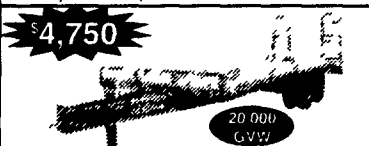
23-ft Long 18-ft Deck & 5-ft Dove Tail, Dual Tandem Adjustable Pintle Plate Oil Bath Axles Spring Assist Ramps, Break Away Kit 20 000 GVW $4,750