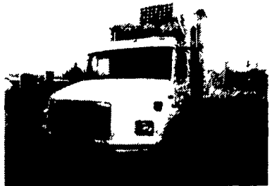
1996 Freightliner FL-70 Cummins 8.3 250 HP 6 Sp/Spring Susp/AC, 140,261 Miles, 33,000 GVW, 22 Ft. Reefer Body, Roll Up Rear Door, Thermoking MD II (Will Separate)