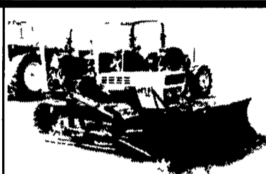
Lamborghini 653 crawler, 1875 hrs. $9,500 $8,500