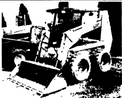
Case 1845C Diesel $8,900