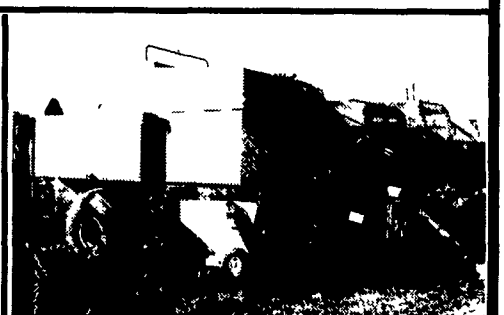
98 New Holland 590, Sq 35"x35" $38,000