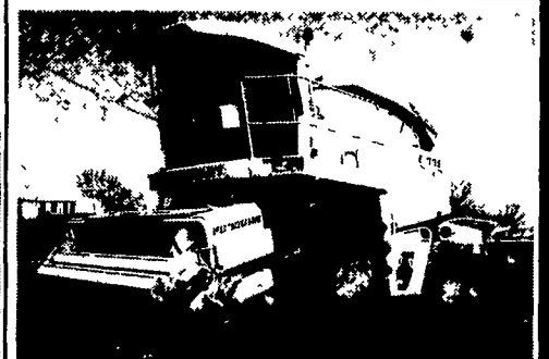
00 Claas 860 4x4 Harvester, 435 HP, 30 5R32 Tires, Corn Cracker Auto Lube, Hyd Outlets, 203 Cutter Hr - 300 Engine, 6 Row, RU 450 Ind Corn Head, 10' Hay Head $233,000