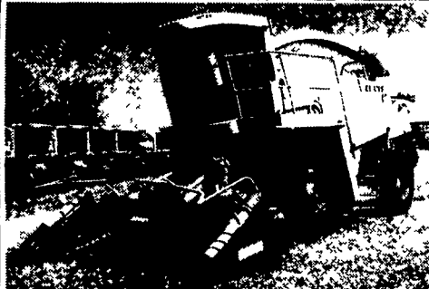
95 Claas 840 4x4, 380 HP, Corn Cracker, 24.5R32 Tires, 1352 Cutter Hr, 2412 Engine, 6 Row Kemper $150,000