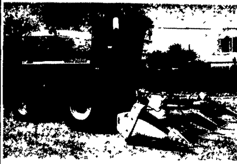
01 JD 6750 4x4 Corn Cracker, 200 Hr, 10' Hay Head, 6 Row Independent Corn Head $189,000