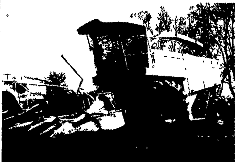
96 Claas 860 4x4, 435 HP Corn Cracker, Auto Lube, 30 5R32 Tires, Hyd Outlets, 1340 Cutter hr, 1892 Engine, 12'5" Hay Head, 6 Row RU450 Independent Corn Head $160,000