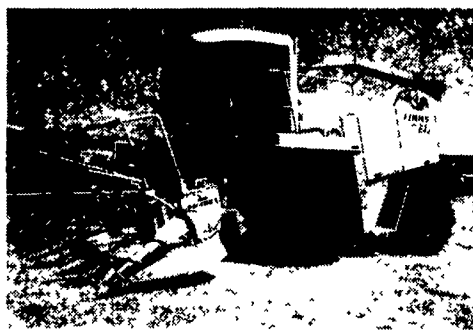
99 Claas 840 4x4 Corn Cracker, 30.5R32 Tires, 982 Cutter Hr, 1101 Engine Hr, Hyd Outlets, RU 450-6 Row, 10' Hay $160,000