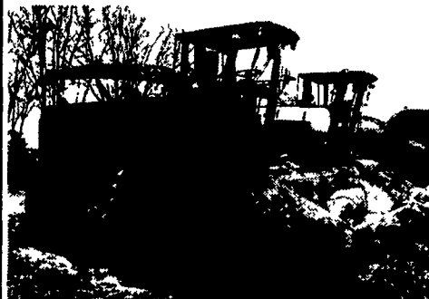
JD 6710 4x4 Corn Cracker Hyd Outlets, 6 Row Corn Head, 10' Hay Head, 1659 Cutter, 2404 Engine $94,000