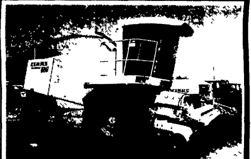
95 Claas 880 4x4, 503 HP, Auto Lube, 24.5 R32 Tires, 1358 Engine Hrs, 1024 Cutter Hr, 10' Hay Head $149,000