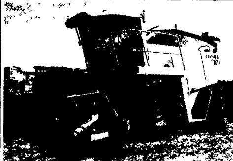
98 Claas 820, 340 HP, 4x4 Corn Cracker, 24.5-32 Tires, 1800 Cutter Hr, Hyd Outlet, 6 Row Kemper $115,000