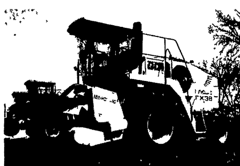
00 FX 38 New Holland, 4x4 Corn Cracker, 700 Cutter Hr, 900 Engine Hr, Hyd Outlets, 6 Row Corn, 10 Hay $176,000