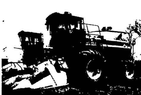
99 JD 6750 4x4 Corn Cracker 30.5R32 Tires, Hyd Outlets, Auto Lube, 1022 Cutter Hr, 1314 Engine, 6 Row Independent Corn Head, 10' Hay Head $155,000