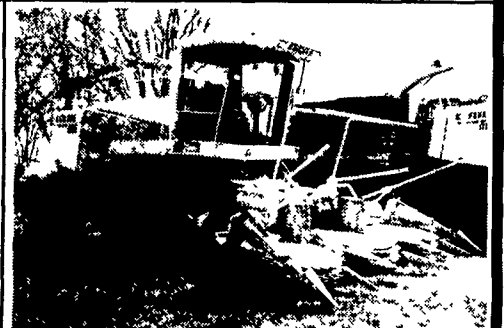
00 Claas 880 4x4, 503 HP, OD Trans, Auto Lube Corn Cracker, 30 5R32 Tires, Hyd Outlets, 8" Cutter Hr - 1146 Engine HR, 6 Row RU 450 Corn Head, 10' Hay Head $229,000