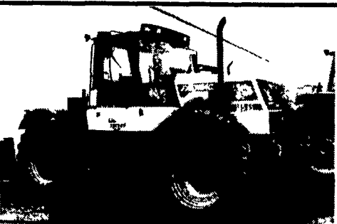
2) JCB 185-65 Fastracs, 180 HP $55,000