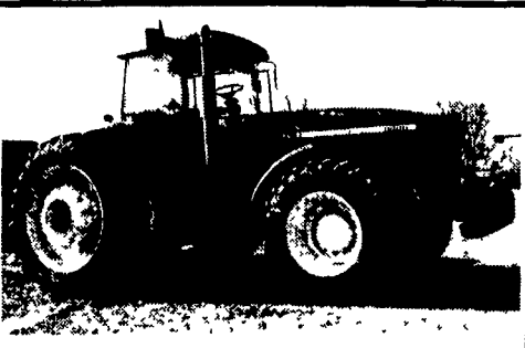
JD 8400 4x4, 225 HP, 18.4R46 With Duals, 4 Remotes $79,000