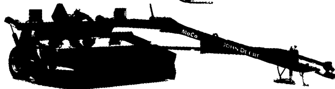
6 Series Rotary MoCos