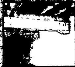
Keystone Kwik-K Beam System helps support pit wall (NCRS approved)