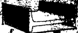
High Capacity H-style Feed Bunker