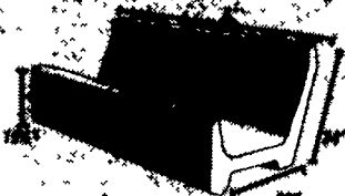
Slant-back J-style Feed Bunker