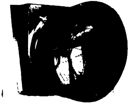
Economical High Performance Fan Galvanized Steel Housing