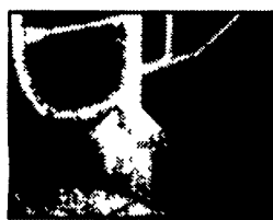
Save Your Curb With Our Stainless Steel Curb Model