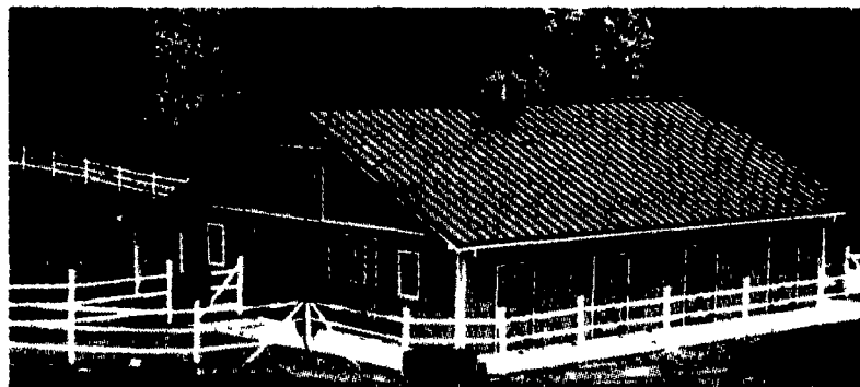
Complete Building Packages, Trusses And Glue-Laminated Timbers

717-866-6581 701 E. Linden St. Richland, PA 17087