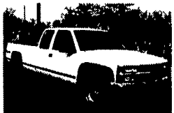
99 Chevy K2500 4x4 Long Bed, 350 V8, 8800 GVW, 77K $17,900