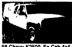
98 Chevy K2500, Ex Cab 4x4, 7.4 V-8, Auto, AC, Front Power Mount Winch, 53,000 Miles $16,900