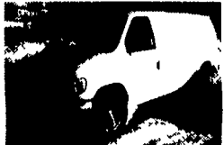
98 Ford E250 Cargo Van, 5.4 V8, Auto, AC, 42,100 Miles $13,900