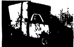
98 GMC 14' Box Truck, 50,000 Miles $15,900