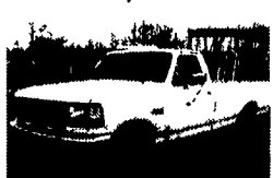
96 Ford F250 4x4, V-8, Auto, AC, 8800 GVW, 105,000 Miles $8,990