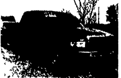
99 Dodge Quad Cab, 4x2, Laramie SLT, 5.2 V8, Auto, AC, 35,307 Miles $16,900