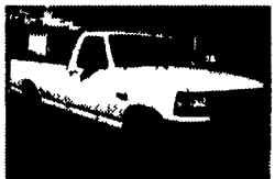
95 Ford F250, 4.9L, 6 Cyl., Auto, AC, 90,300 Miles $5,990