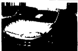
2001 Dodge Intrepid SE, 15,210 Miles, Pre-Collision Damage Repaired $10,900