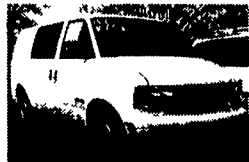
99 GMC Safari Cargo Van, V6, Auto, AC, 29,210 Miles $12,900