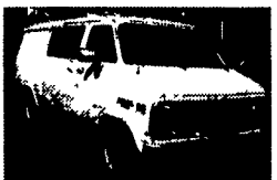
91 Chevy C20 Cargo Van, V8, Auto, AC, 128,000 Miles $2,990