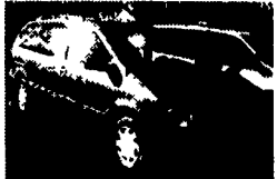
99 Toyota Sienna LE, V6, Auto, AC, Quad Seats, 67,000 Miles $15,900