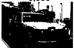
96 Ford F250 Ex. Cab, Utility, 5.8 V8, Auto, AC, 105,000 Miles $9,900