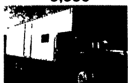
92 International DT466, 28' Box Diesel, 5 Speed, 25,500 GVW, 1 Owner, 28,383 Miles $21,900