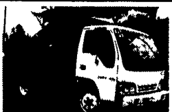
2000 Isuzu NQR, Diesel, 6 Speed, Elec. Dump, 17,900 GVW, 5192 Miles $31,990