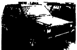
98 Jeep Cherokee Sport, 4.0 L, 6 Cyl., Auto, AC, 16,110 Miles $14,900