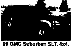
99 GMC Suburban SLT, 4x4, Turbo Diesel, Auto, Rear AC & Heat, 3rd Seat, Leather, 38,627 Miles $29,900