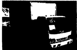
99 Isuzu HD 16' Box, Diesel, 5 Speed, 115,000 Miles $15,900