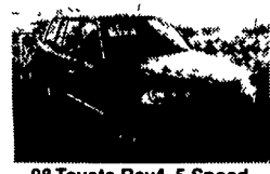
98 Toyota Rav4, 5 Speed, PS, AC, 19,000 Miles, Factory Warranty $14,900