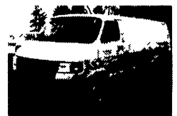
97 Dodge Ram 3500 Ext. Cargo Van 360, V8, Auto, A/C, 105,348 Miles $8,990