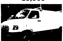
97 Dodge Ext. Cargo Van, V6, Auto, AC, 37,000 Miles $10,900