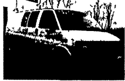
2000 Chevy 3500 Ext. Cargo Van, V8, Auto, AC, 27,000 Miles $15,900