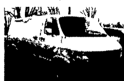
95 Dodge B1500 Cargo Van V-6, Auto, AC, 121,000 Miles $4,990