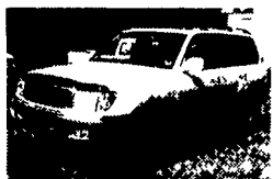
99 Toyota Land Cruiser, Leather, 4x4, 55,000 Miles $34,900