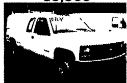
95 Chevy K2500 Ex. Cab, 4x4, 350 V8, Auto, AC, Utility Cab, 102,359 Miles $9,990