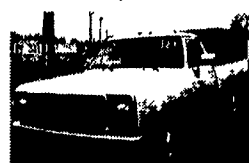
93 Dodge Ram 1500 Truck V8, Auto, No A/C, Local Trade, 159,000 Miles $3,990