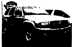
99 Dodge Durango SLT, Auto, Dual AC, Sunroof, Leather, 18,310 Miles $22,900