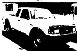
96 Ford Ranger Ext. Cab 4x4, V-6, Auto, AC $6,990