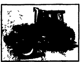
A 24148 1998 Case IH 8940 MFD Cab, 950 Hours, 1000 RPM PTO, AC/Heat, 3 Remotes, 18 Speed Full Powershift, 3Pt Hitch, 20 8R42 Duals, 205 HP+