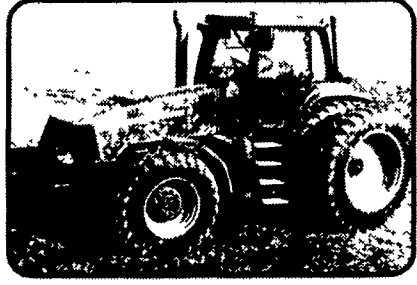
B 42284 2000 Case IH MX 220 MFD Cab, 1033 Hours, 540/1000 PTO, 3 Pt Hitch, 4 Circuit Remotes, 16x46 Rear Tires, 185 HP+