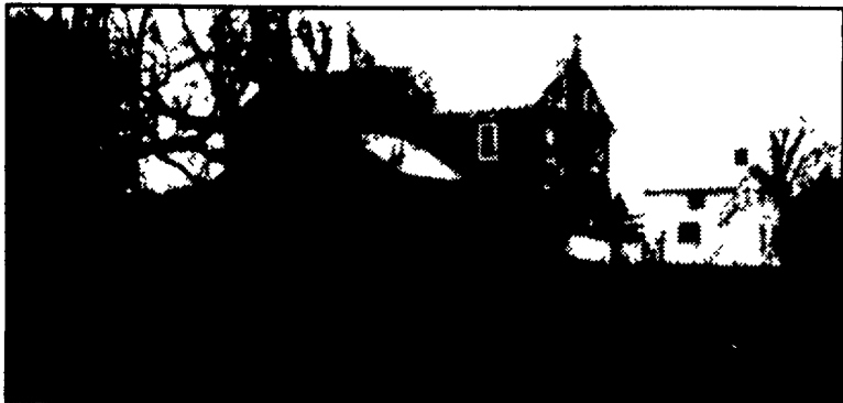
This Fine Berks County Farm.

We Are Pleased To Offer At Public Auction