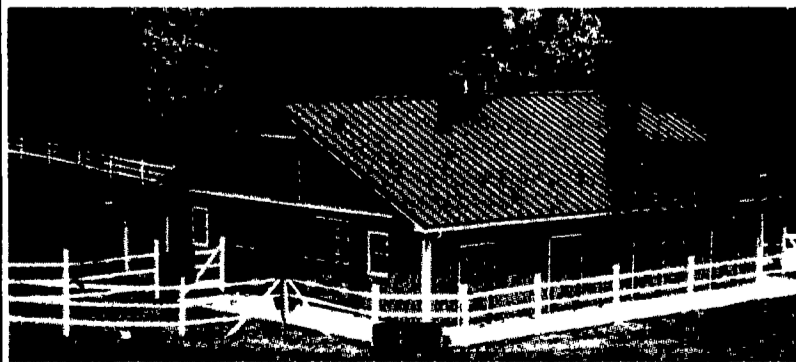
Complete Building Packages, Trusses And Glue-Laminated Timbers

717-866-6581 701 E. Linden St. Richland, PA 17087