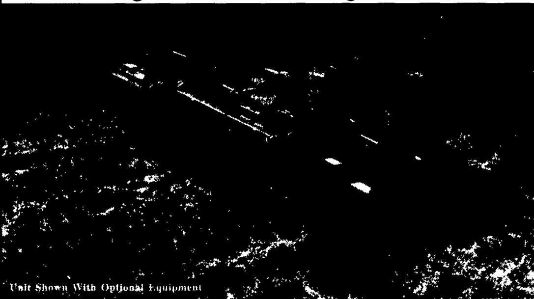
Unit Shown With Optional Equipment