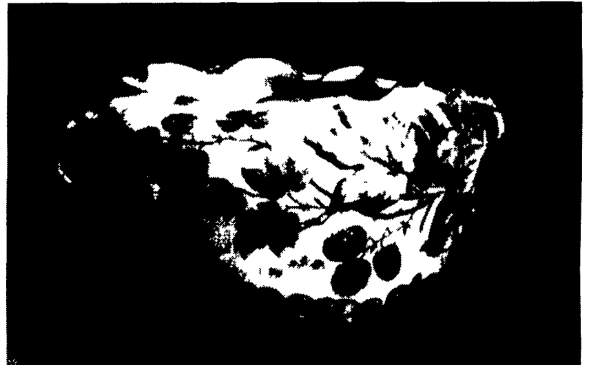
Ott and Brewer porcelain "Belleek" plant pot, c.1890. Sold at Skinner auction for $1,057.50.