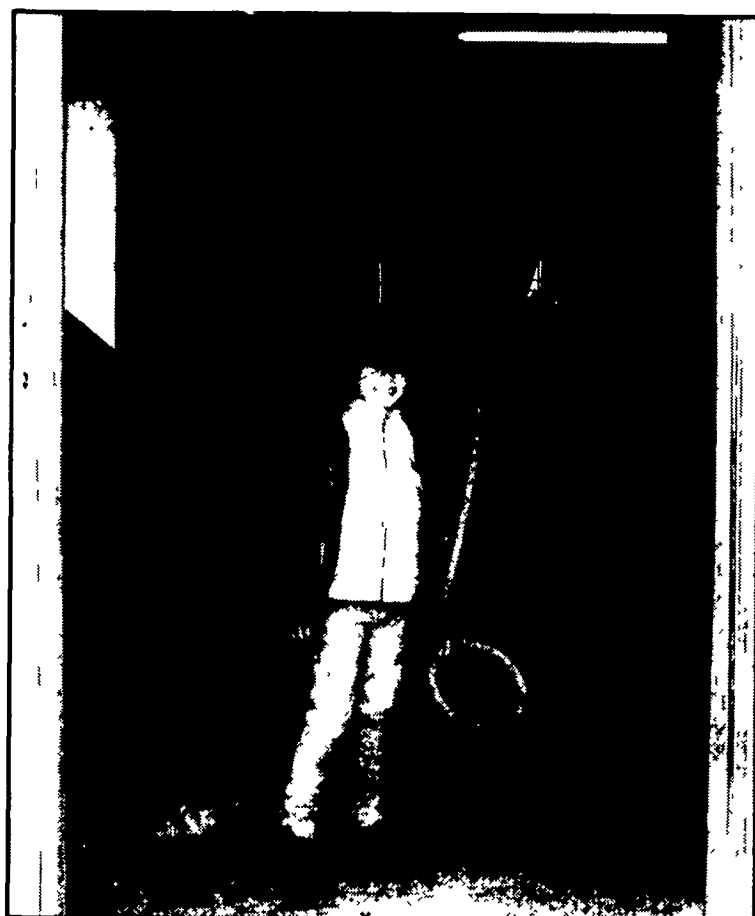
Emily and Merrylegs relax together before they ride to the large arena.

Rainbow Ridge Farm Equestrian Center 5590 Bradshaw Road Pipersville, PA 18947 (215) 766-9357