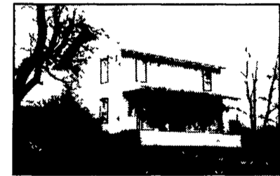
Anna G. Fitzwater Home

Auction to be held on site Sunday, April 21, 2002 at 2 PM