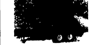
Triple Crowns Dump Trailer 6'x10', 6'x12', 7000 lb GVW & 10,000 lb GVW Powder Coated 6'x12', 12,000 lb GVW, twin cylinders, 750x16 tires, 8 lug