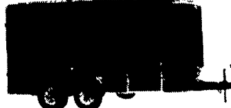
Closed Utility Trailers 3,500# tandem axles, 24" crossmembers on floor, 16" crossmembers on walls, 3/8" plywood walls, 3/4" plywood floors