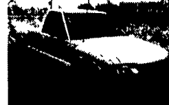
98 Isuzu Hombre Truck 4 Cyl, Auto, A/C, 25,029 Miles $5,990