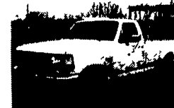
96 Ford F250 4x4, V-8, Auto, AC, 8800 GVW, 105,000 Miles $8,990