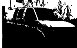
2000 Chevy 3500 Ext. Cargo Van, V8, Auto, AC, 27,000 Miles $15,900