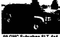
99 GMC Suburban SLT, 4x4, Turbo Diesel, Auto, Rear AC & Heat, 3rd Seat, Leather, 38,627 Miles $29,900