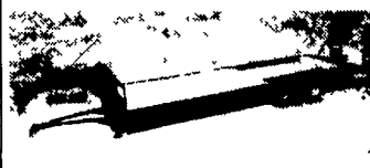
28' Tandem Dual Gooseneck load capacity 20,000#, height of deck 35", 10" I-beam frame, 10,000# tandem dual oil bath axles, all wheel electric brakes with breakaway kit