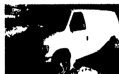
98 Ford E250 Cargo Van, 5.4 V8, Auto, AC, 42,100 Miles $13,900