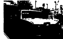
96 Ford F250 Ex. Cab, Utility, 5.8 V8, Auto, AC, 105,000 Miles $9,900