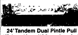
24' Tandem Dual Pintle Pull 10" channel frame (15 3 pounds per foot), tandem dual oil bath axles, all wheel electric brakes with breakaway kit, 2" treated wood floor (20' flat deck, 4' dovetail), stake pockets and rub rails