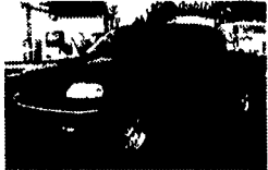
2001 Ford Super Crew Cab 4x4, V-8, Auto, AC, 56,000 Miles $22,900