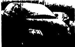
2001 Dodge Grand Caravan Sport, Quad Seats, V6, Auto, Dual AC, 9,100 Miles $20,900