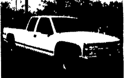
99 Chevy K2500 4x4 Long Bed, 350 V8, 8800 GVW, 77K $17,900