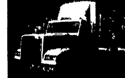
96 Freightliner Day Cab; Cummins M11, 330Hp, 10 Speed, Air Brakes, 600,000 Miles $15,900