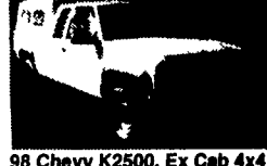
98 Chevy K2500, Ex Cab 4x4, 7.4 V-8, Auto, AC, Front Power Mount Winch, 53,000 Miles $16,900