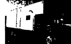
92 International DT466, 28' Box Diesel, 5 Speed, 25,500 GVW, 1 Owner, 28,383 Miles $21,900