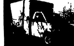
98 GMC 14' Box Truck, 50,000 Miles $15,900