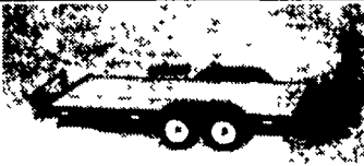
18' Contractors Special capacity 12,000#, 6" channel frame with 6" channel wrap-around tongue, two 6,000# eight lug 750x16 Tires, all wheel electric brakes with breakaway kit