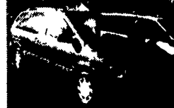
99 Toyota Sienna LE, V6, Auto, AC, Quad Seats, 67,000 Miles $15,900