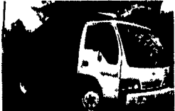
00 Isuzu NQR, Diesel, 6 Speed, Elec. Dump, 17,900 GVW, 5192 Miles $31,990