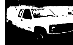
95 Chevy K2500 Ex. Cab, 4x4, 350 V8, Auto, AC, Utility Cab, 102,359 Miles $9,990