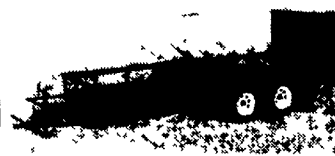
Landscape Trailer 16'x77", 18'x77" 16'x83", 18'x83", w/3500lb or 5200lb axles, radial tires, brakes all the way around, w/break away