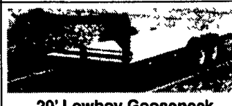
20' Lowboy Gooseneck 6" channel frame w/3" channel crosspieces, two 5200# EZ Lube axles-all wheel elec. breaks w/breakaway kit, 2" treated wood floor, 20' flat deck, 83" between fenders, stake pockets & rub rail, chain box between neck uprights

1320 Rock Springs, Rising Sun, MD 1/2 Mile South of Lancaster County on Rt. 222; Open 7 Days A Week: Mon.-Sat. 8-6; Sun. 8-4 410-658-5978 • 1-800-858-0288 *90 Days Same As Cash With Approved Credit*