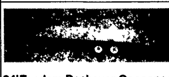
24' Tandem Deckover Gooseneck load capacity 13,000#, 8" I-beam frame, two 7,000# eight lug EZ Lube axles, all wheel electric brakes with breakaway kit