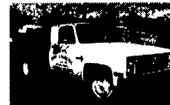
87 Chevy 1 Ton Dump, 350 V-8, 76,325 Miles $6,990