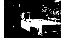
76 Chevy 1 Ton Dump, V-8, PS, No AC $3,990