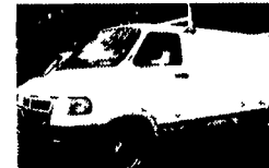
97 Dodge Ext. Cargo Van, V6, Auto, AC, 37,000 Miles $10,900