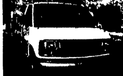
99 Chevy G3500 Cargo Van, 350 V8, Auto, AC, 8,600 GVW, 35,000 Miles $15,900