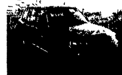
98 Toyota Rav4, 5 Speed, PS, AC, 19,000 Miles, Factory Warranty $14,900