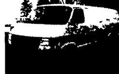
97 Dodge Ram 3500 Ext. Cargo Van 360, V8, Auto, A/C, 105,348 Miles $8,990