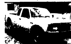
96 Ford Ranger Ext. Cab 4x4, V-6, Auto, AC $6,990