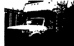
97 Ford F350, 4x4 w/Dual Rear, 460 V8, Auto, AC, 33,000 Miles $14,900