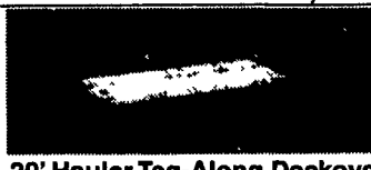
20' Hauler Tag-Along Deckover Trailer Weight 3000#, Load Capacity 9,000#, Height of deck 35", 8" I-beam frame, 5200# EZ Lube axles - all wheel electric brakes w/breakaway kit, 2" treated wood floor, 16' flat deck, 4' wood dovetail, stake pockets and rub rail