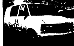
99 GMC Safari Cargo Van, V6, Auto, AC, 29,210 Miles $12,900