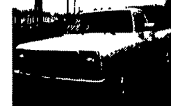
93 Dodge Ram 1500 Truck V8, Auto, No A/C, Local Trade, 159,000 Miles $3,990