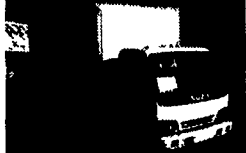
99 Isuzu HD 16' Box, Diesel, 5 Speed, 115,000 Miles $15,900