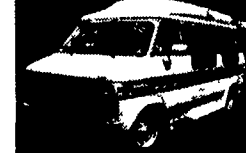
93 Chevy Hi Top Conversion Van 350, V8, Auto, Dual A/C, 85,256 Miles $8,990