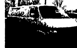
95 Dodge B1500 Cargo Van V-6, Auto, AC, 121,000 Miles $4,990