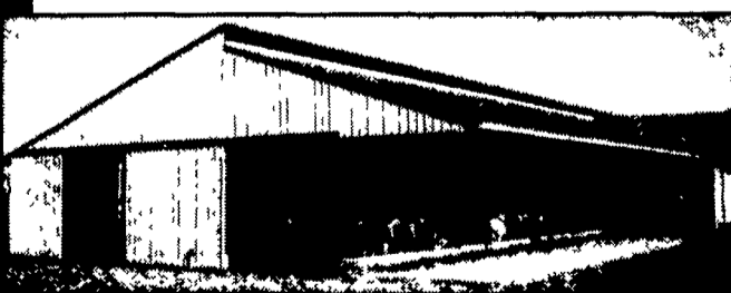
Free Stall Milking Center

State-of-the-Art 1,000 Cow Milking Facility