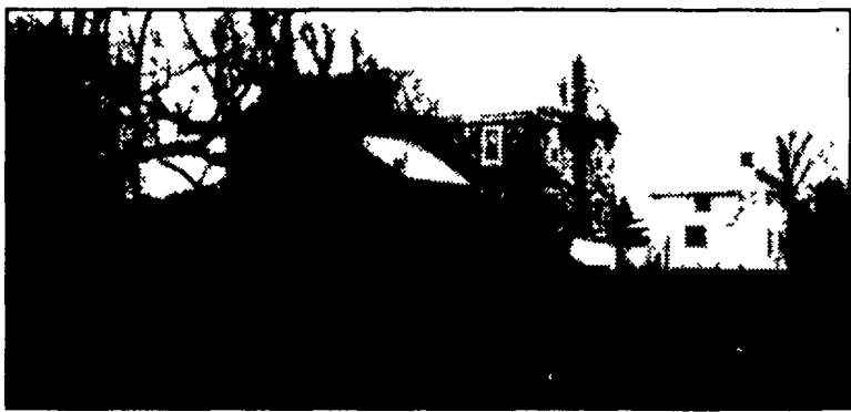
This Fine Berks County Farm.

We Are Pleased To Offer At Public Auction