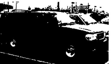
99 FORD EXPLORER XLT Maroon, 4x4, Auto, "Ford Certified", #P5007