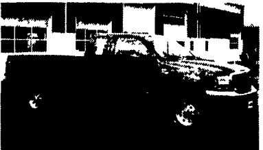
00 FORD F350 XLT "Power Stroke Diesel", Super Cab, 4x4, #P5012