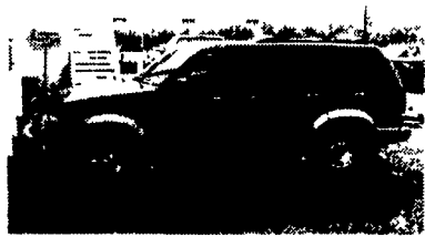
98 FORD EXPLORER "Eddie Bauer" "Sport Utility Luxury"