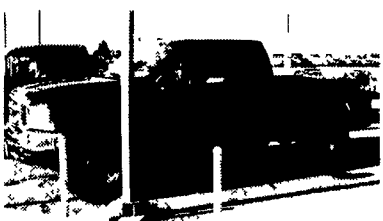
2000 FORD F250 Ext. Cab 4x4, XLT, #4315F

20th & Cumberland Sts. Rt. 422 West 9-9 Daily, 9-5 Sat.