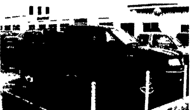
99 FORD F150 4x4 Extend Cab, XLT, Off Road, #P5019

Credit Problems? Call 1-888 CARS 4 You TRUCKS - UTILITY VEHICLES - TRUCKS