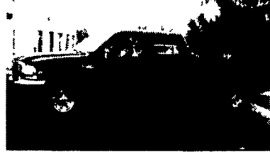
99 FORD F250 XLT Crew Cab, 4x4, "Perfect Work Truck", #PL5032