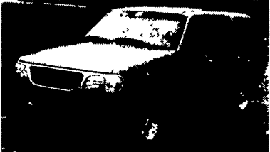
98 FORD EXPLORER V-8, AWD, P5005 "Must See"