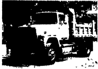
1988 FORD L-8000 Dump Single Axle 7 8 240 HP Ford Brazil Engine RT-8607 Transmission, Single Speed Rear, 315-80-22 5 Front Tires 12R-22 5 Rear Tires, Dayton Wheels, 10 Foot Steel Body, 30 inch Sides, Stock #1384 GVW 38,000 $8,900