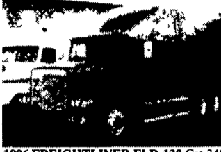
1996 FREIGHTLINER FLD-120 Cat 3406 E 435 HP with Jacob Brake, RTO-16210 C Transmission, Air Ride Eaton DS-404 3 90 Ratio, 11R-24 5 Tires, Pilot Wheels Dual Stacks, 70 Inch Sleeper, 239 Inch Wheelbase, Engine Man Have Had HP Increased $15,900