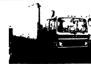
1988 MACK MS MIDLINER 205 HP Mack Renault Engine, 10 Speed Spicer Trans-mission, Single Speed Rear, 20 Foot Dry Van Body, 11R-22 5 Tires, Budd Wheels, Mileage 183,867, Stock #1313, 33,000 GVW $7,900