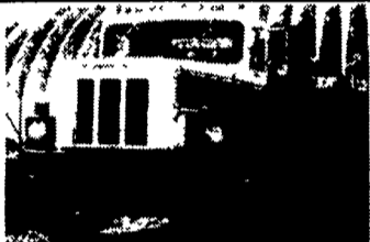
1974 INTERNATIONAL PAYSTAR 5000 Cummins 270 Engine RTF 9513 Transmission, IHC 44,000 Pound Rears, 315-80 22 5 Tires On Front 10 00-20 Tires On Back, Dayton Wheels, Flatbed With Crane Stock #1411 $4,900