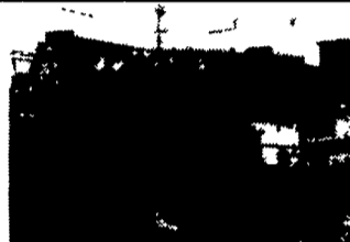
10 FT. STEEL DUMP BODY , with Subframe, Cab Overhang, 28 1/2 Inch Sides, with Warren Salt Spreader $1,200