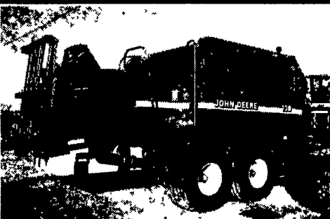
01 JD 100 Sq. Baler, 4000 Bales $38,000