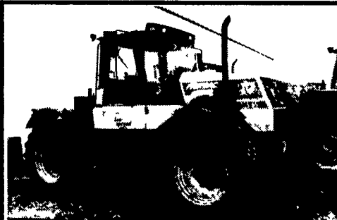
(2) JCBs Just Traded