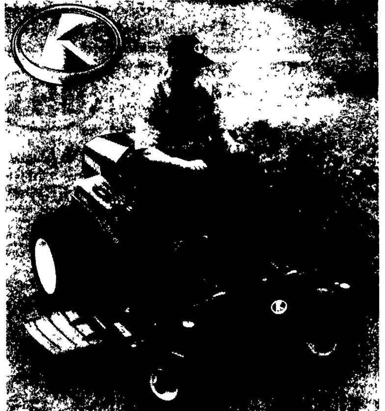
The Kubota ZD Series Zero-Turn mowers are designed to meet or exceed expectations of professional users