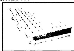
Cattle "Waffle Slat" 8000 psi