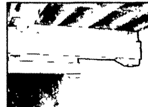
Keystone Knuckle Beam System helps support pit wall (NCRS approved)