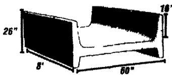
High Capacity H-style Feed Bunker