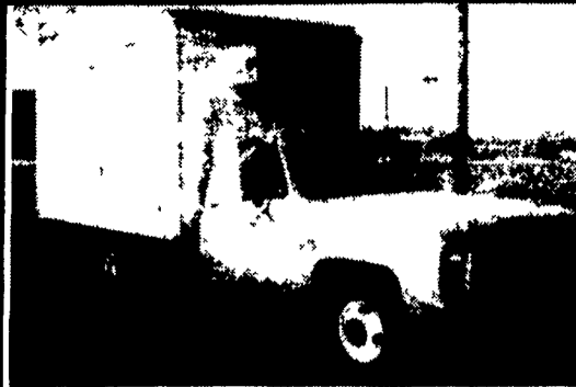
1983 Chev, Runs Good & Unit Runs, Will Separate.....$3,500

6:15 - 5:00 M-F 7:00 - 1:00 Sat Ship Daily