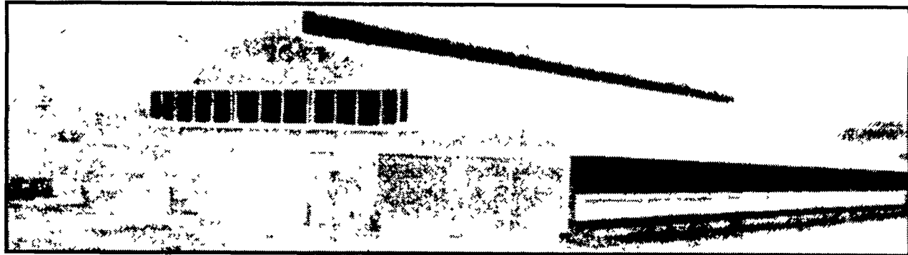
300 Cow Freestall Barn Designed and Constructed by Triple H Construction, Ephrata, PA