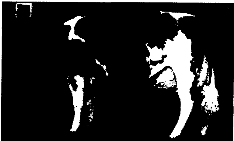
Elm-Park Moselle-Red-ET, bred and owned by Elm-Park Farms, Ltd. in Sheboygan Falls, Wis., has completed the new record production of 54,721 pounds of milk with 1,502 pounds of butterfat and 1,615 pounds of protein.

The Red and White Dairy Cattle Association was founded in 1964 to promote the breeding and development of Red and White dairy cattle and has been located in Crystal Spring since 1975. The association is based on the principle of an open herdbook. There are now more than 120,000 animals registered in the herdbook and 800 members in the association.