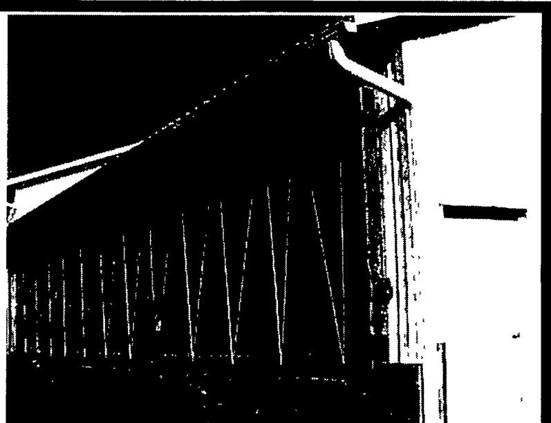
Delta, PA 8'x48' Installation

For additional information contact the Wayne County Cooperative Extension at (570) 253-5970, extension 239.