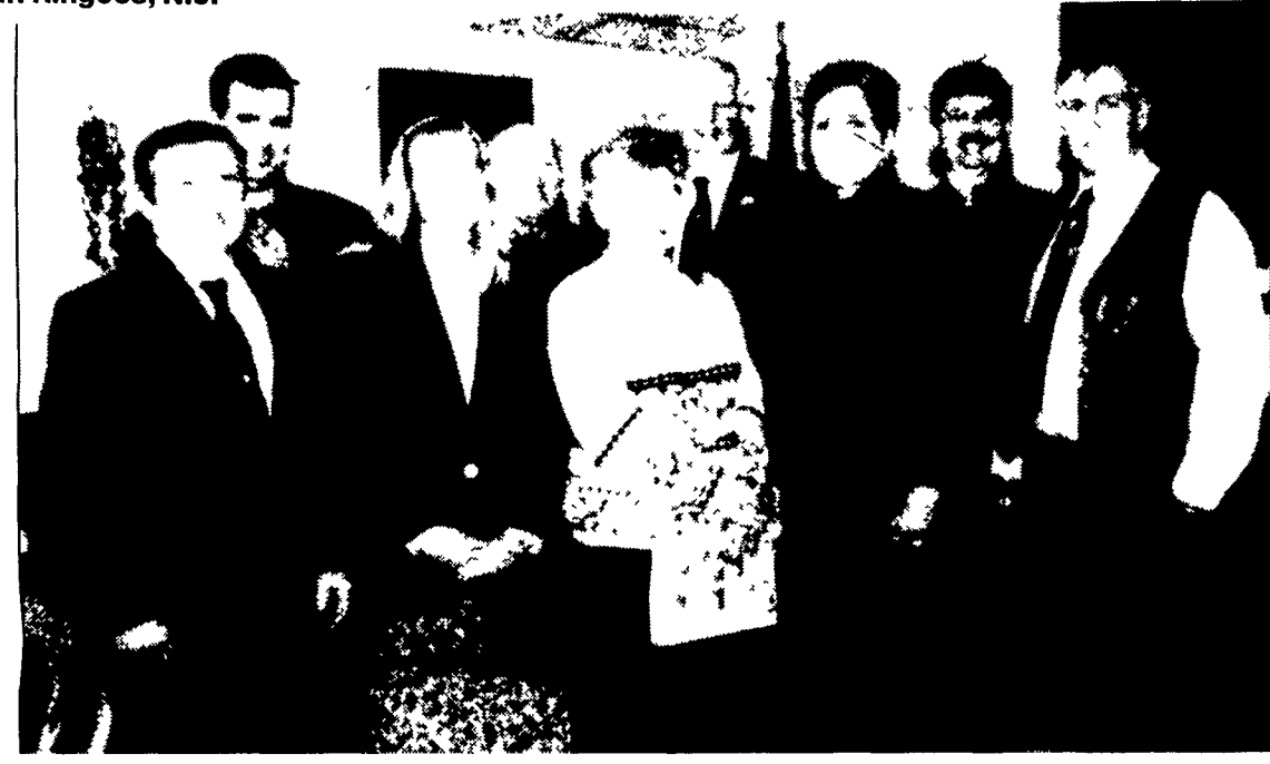
Directors and officers of the New Jersey Holstein-Friesian Association gather before the banquet last Saturday at the Amwell Valley Fire House in Ringoes, N.J.