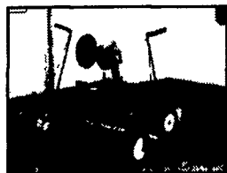
SUPER DELUXE FLATBED MULCH LAYER