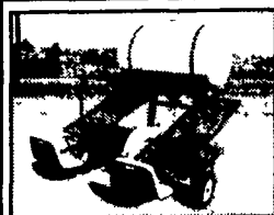
MODEL P150 WATER WHEEL PLANTER