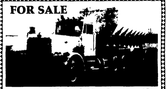
FOR SALE 1974 Peterbilt Mod. 359, Cummins 350, Fuller 13 Trans., Rockwell Rear, Wet Line, With Bulk Trailer, Rebuilt Engine. $5,000 Call 610-285-6519