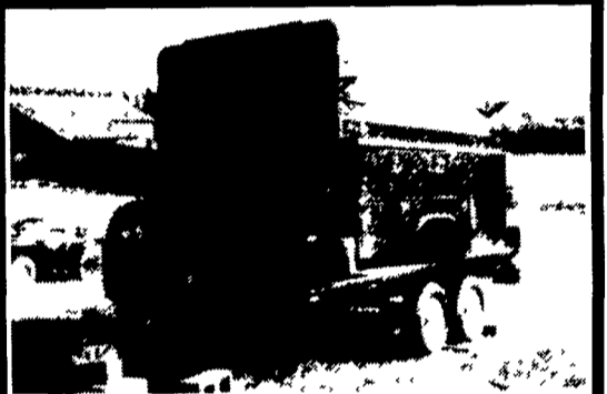
95 READING WALK-IN UTILITY BODY, Dual Wheel, Came Off Of 95 Ford Truck, Very Good Condition New Was $8,000 - NOW $1,800 - 570/282-3265