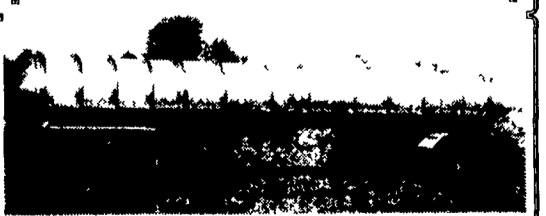
1976 Polar Stainless Steel Vacuum Tanker, 5500 Gal., Diesel Eng., PB8 400 CFM Pump, Good Condition, Retiring...$14,900 OBO 410/452-5660 After 6PM 717/456-7497 Nick