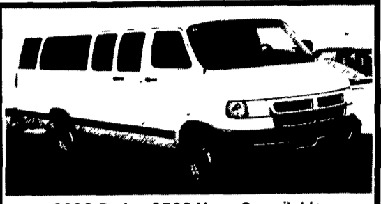
2000 Dodge 3500 Van - 2 mi. available Low Miles with Factory Warranty @ $15,995 Van Campen Motors, Inc. 601 West Third Street, Williamsport, PA 17701 570/326-0567