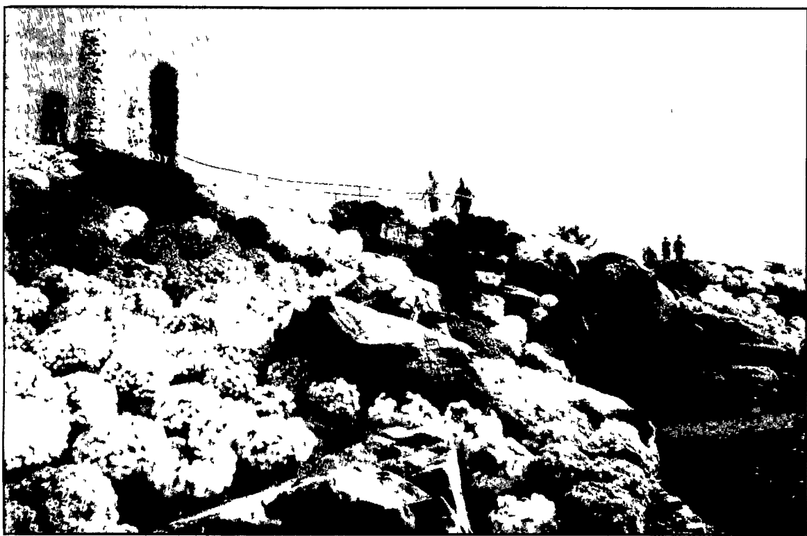
Ott's Exotic Plants near Schwensville is home to the "Mountain of Mums" in fall and the "Mountain of Pansies" in spring. Read more about the eye-catching display in this issue of Lancaster Farming's Grower & Marketer.

Vol. 47 No. 13 www.lancasterfarming.com Five Sections Saturday, January 26, 2002 $34.00 Per Year 75¢ Per Copy