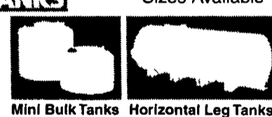
Mini Bulk Tanks Horizontal Leg Tanks