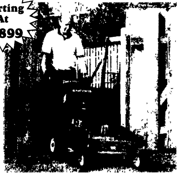
Decks for every size job 32" to 52"

See the ENCORE Mowers At Your Local Dealer